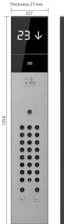
KSC 220 Partial height COP, surface mounted