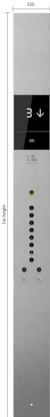
KSC 220 Full height COP, flush mounted